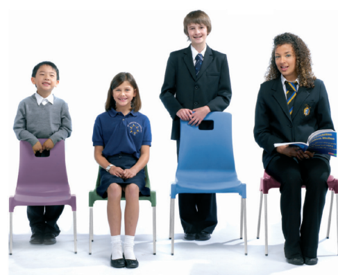
ST chairs by Metalliform FIRA Certified to EN 1729, Part 1 and 2

The previous standard was based on furniture dimensions used in the 1970s. The dimensions in the new standard make sure furniture matches the sizes of today's school children.